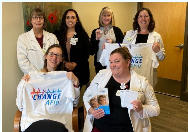
Sparrow Hospital in Lansing, MI