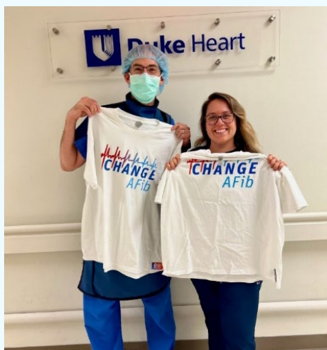
Duke University in Durham, NC

Thank you to those who participated! We enjoyed seeing your smiling faces across the country while helping us CHANGE AFib!