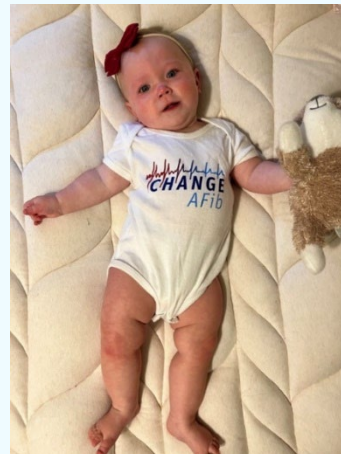
AHA Trial Team in Dallas, TX