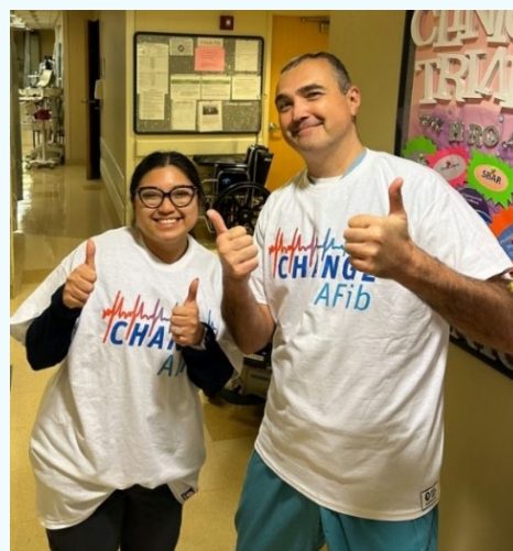
The Valley Hospital in Ridgewood, NJ